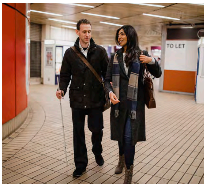
It is important to choose service providers that will help you reach your goals.